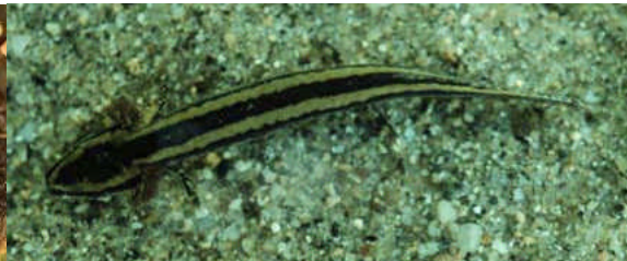
Tiger salamander *flat toes, irregular spots extending onto belly *larvae without balancers